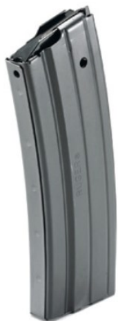
Mini-14® 5.56 NATO/.223 Rem. 30-Round Magazine

(5.56 NATO/.223 Rem) as the Subject Rifle, capable of accepting detachable magazines. See https://ruger.com/products/mini14RanchRifle/specSheets/5816.html . Large capacity magazines for the Ruger Mini 14 are readily available: